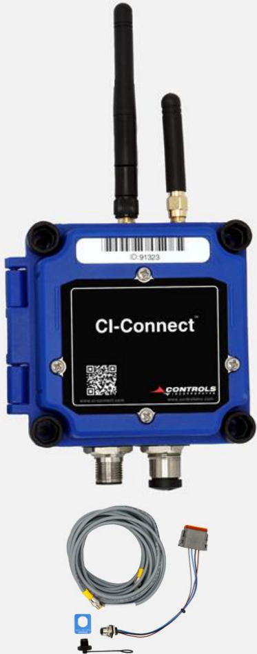
CI CONNECT™ PANEL INSTALL KIT Part# 3FK-500